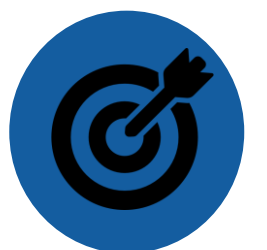
Data Driven Actions